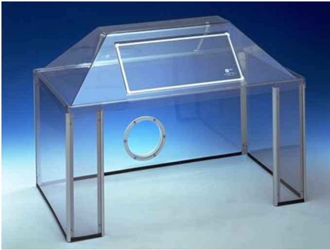
Figure 3: Semi-open extraction cabinet for use, e.g., in laboratories

Open systems are form elements that are offered in a wide variety of versions. Their use is defined by shape, geometry, and material. They are usually mounted on extraction arms, the use of which is also defined by the amount and type of pollutant and other parameters such as use under ESD conditions or under fire protection aspects. The diameter of the extraction arms and their installation – directly on the filter system, as table or wall mounting, etc. – results from their practical utilization. Capturing elements can also be attached to suction hoses.