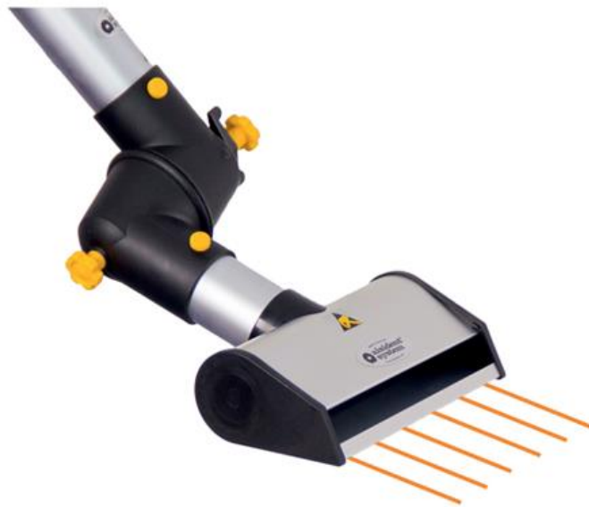
Figure 4: Suction nozzle uses the Coandă effect

Suction nozzles use the Coandă effect, which means that air or gases move along a convex surface instead of detaching and continuing to flow in the original direction of flow. During gluing or cleaning with solvents or when vapors are generated that are heavier than air, these capturing elements are usually positioned flat and to the side of the pollutant source.