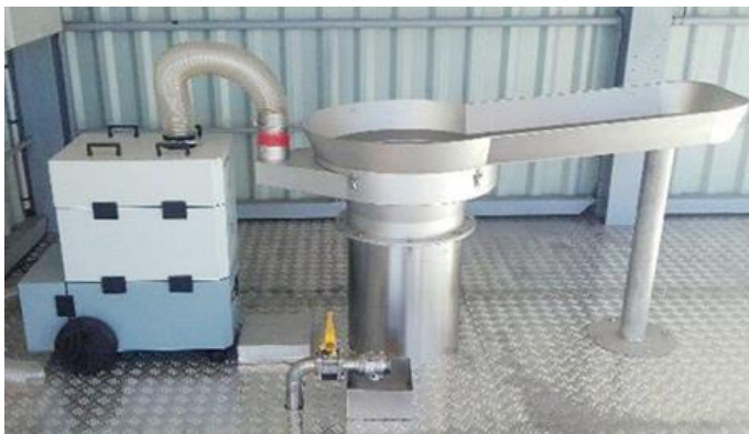
Figure 5: Barrel suction to capture rising dusts

Barrel suction – when filling containers, rising dusts had to be captured. This was done by means of a ring nozzle that surrounds the vessel opening.