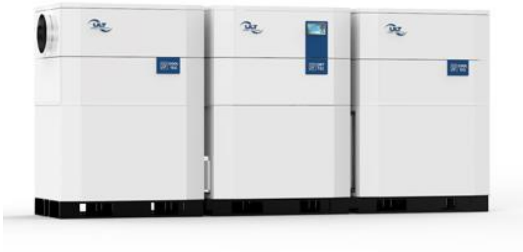
Image 5: Modular concept ULT Dry-Tec® with precooler and postcooler

Based on the ULT Dry-Tec module concept, users can put together a system for air conditioning that matches the process requirements. This concept enables for flexible installation also of smaller individual system components in existing technical rooms, even where space is limited. Additionally, user may refer to the numerous options of the concept to adapt the system individually to their needs. For example, the on-site integration and control of the system via the building management system is available for many different systems.